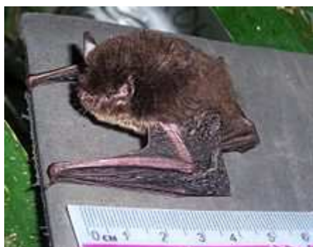
1 Myotis muricola from Kuningan, West Java. Otherwise known as the Wall-roosting Mouse-eared bat, it is a species of vesper bat. They are typically insectivorous and nocturnal.

http://www.pertanika.upm.edu.my/Pertanika%20PAPERS/JTAS%20Vol.%2035%20(2)%20May.%202012/12%20Pg%20271-292.pdf