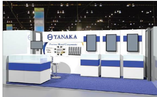
Artist's impression of booth

Exhibiting ultra-fine wire coiling material and other precious metal materials, produced using unique technologies, for a wide range of applications such as sensors and electrodes