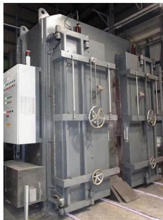
Furnace used for processing cyanogen compounds

Tanaka Kikinzoku Kogyo will continually search for opportunities to contribute to waste reduction, precious metals recycle and generation of environmentally-friendly products.