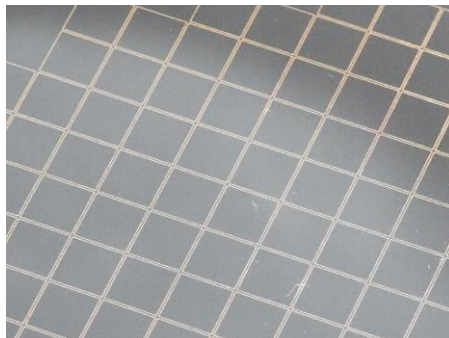
AuRoFUSE™ sealing frames (200 micrometers wide) printed on an 8-inch wafer