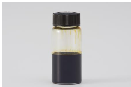
Low-temperature sintered silver nano ink

This technology will contribute to thinner devices, increased flexibility, and higher image quality of smartphone touch panels, organic electroluminescence displays, and other applications.