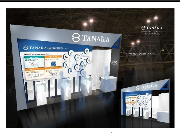
<Artist's rendering of booth>

First exhibition of a large catalyst coated membrane sample for evaluating electrode catalysts for water electrolysis and precious metal plating technology TANAKA will present hydrogen-related technology