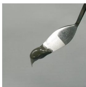
UV700-SR1J product sample