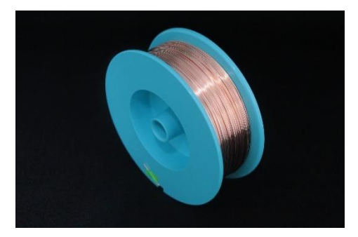
<Cu Bonding Wire for Power Devices>