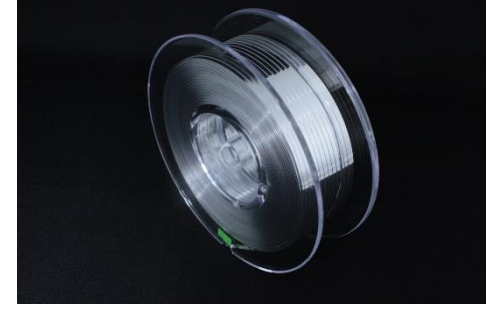
<Al Bonding Ribbon for Power Devices>