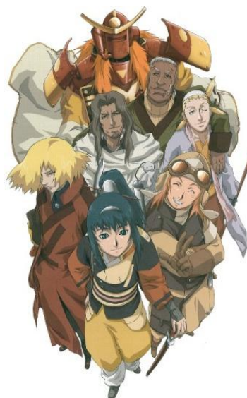
"Samurai 7" key visual ©2004 AKIRA KUROSAWA /SHINOBU HASHIMOTO /HIDEO OGUNI/NEP・GONZO

(4) Event Navigator: Noriko Namiki (voice actress)