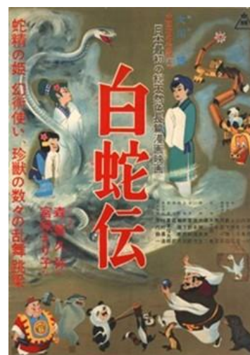
"The White Snake Enchantress" key visual

The White Snake Enchantress, a tale passed down through ancient China, is a beautiful love story between Bai Niang, the reincarnation of a white snake, and her lover Xu Xian. Based on this folk tale, the story unfolds with the addition of characters like the blue fish spirit Shao Qing, Xu Xian's pet pandas, Panda and Mimi, and the monk Fa Hai who seeks to tear Bai Niang and Xu Xian apart. It is a lavish epic woven with beautiful music and rich colors.