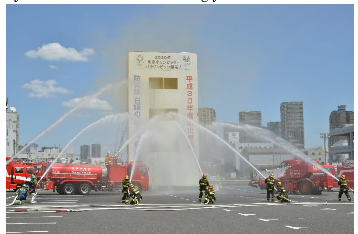
Scenes from previous exhibition (2018)

The main exhibits during the exhibition period will include the latest technologies and high-profile products to protect against fire and disaster in the four areas of "Fire Extinguishing / Ambulance Service / Rescue / Evacuation Systems" "Disaster Prevention, Mitigation and Disaster Preparedness" "Information Systems / Communication Services" and "Others, Products and Services for Fire and Disaster Prevention"